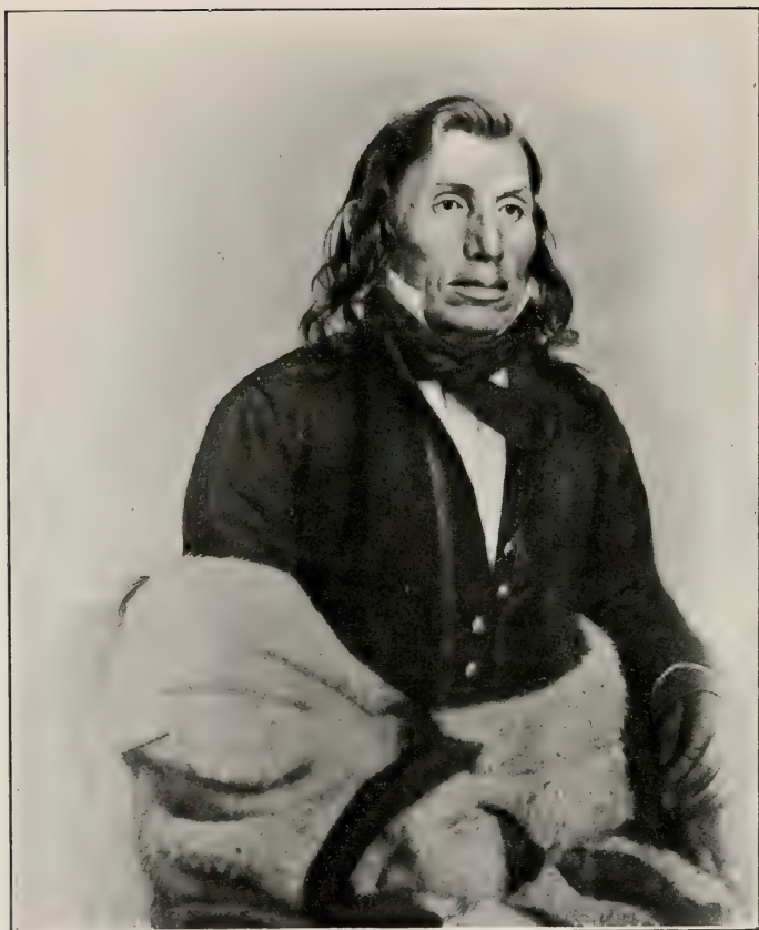
TA-Ó-YA-TE-DÚ-TA (HIS RED PEOPLE) CALLED Little Crow

From an ambrotype presented to the author by the chief.